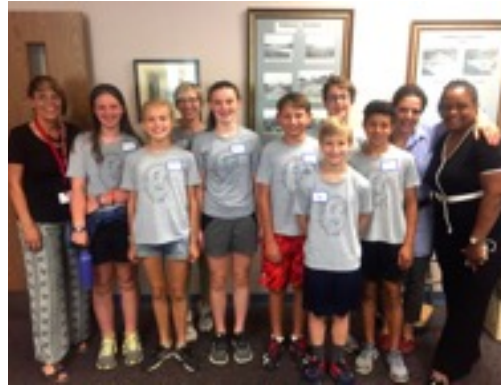
Project Serve Campers visit Matt Talbot Inn in Parma to learn about the dangers of addiction.